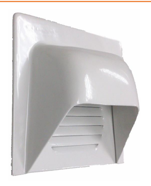
Model VC vent caps are specifically designed for bathroom and kitchen exhausts, storage rooms, attics, basements. This model of vent caps build with the hood for protecting the elements.